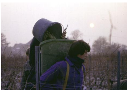
Grapes are picked with tender care in the quiet morning or evening hours to conserve the aromas.

The varietal's individual personality determines how the vine is cultivated. We gain further improvements by deliberately reducing the yield, which is achieved through previous shoot and cluster thinning. The final result is a difficult to attain 25 percent quality increase.