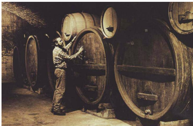
Centuries of winemaking know-how stand behind each bottle of Schales wine.

prefer a reductive, gentle approach to conserve the primary aromas and produce fresh wines.