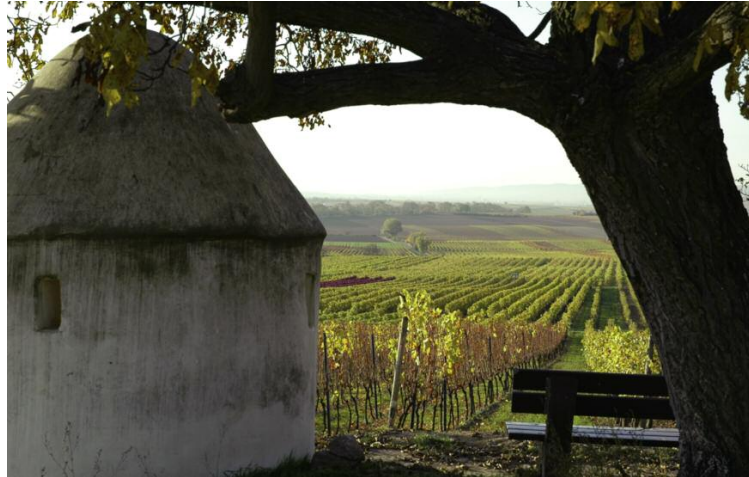
Trullo cottages left by the Romans—the first to recognize the area's perfect wine-growing conditions—still stand watch over the Schales vineyards.

Since 1783, the Schales estate has been producing superb vintages that are the fruits of generations. After centuries of experience, today the Schales winery is one of the top 10 privately-owned estates in Germany and leading growers in Rheinhessen, the